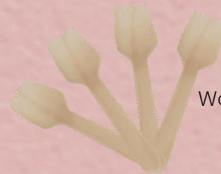
Wooden Spoons 1000pcs