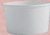
5oz/180ml White Bio