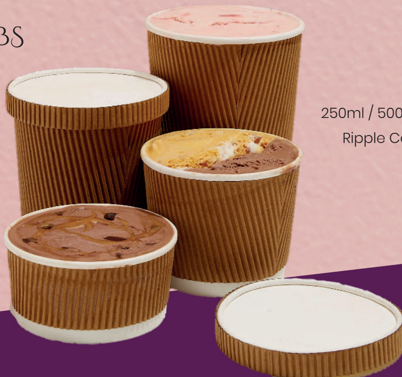
250ml / 500ml / 750ml / 1000ml Ripple Container with Lid