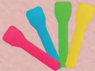
Paper Spoons 500pcs