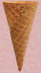
#7 Gluten Free Flat Waffle Top (128 x 50mm) 144 pcs