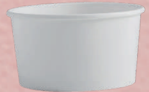
8oz/250ml White Bio