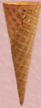
#5 Flat Top Waffle C (148 x 50mm) 216 pcs